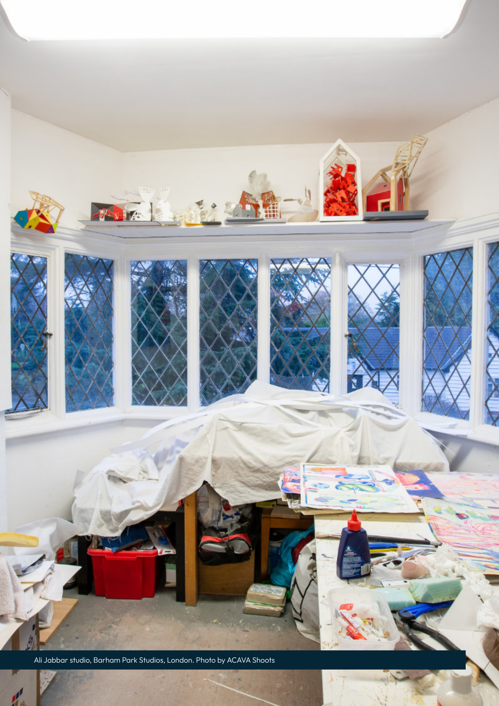
Ali Jabbar studio, Barham Park Studios, London.