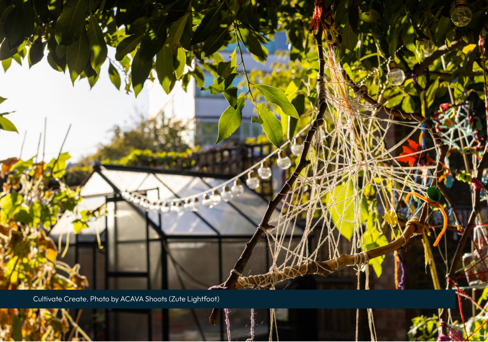
Cultivate Create.