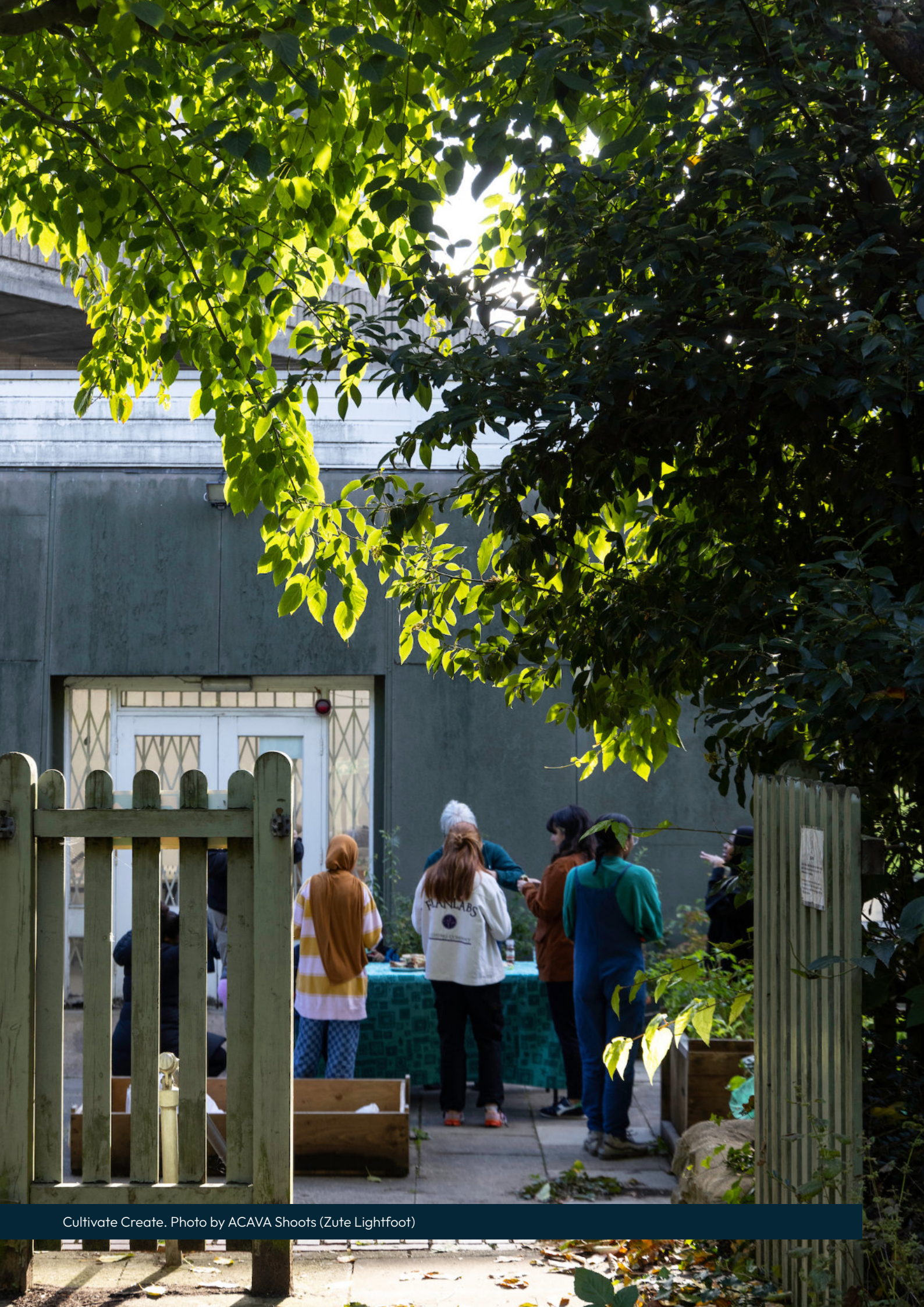
Cultivate Create.