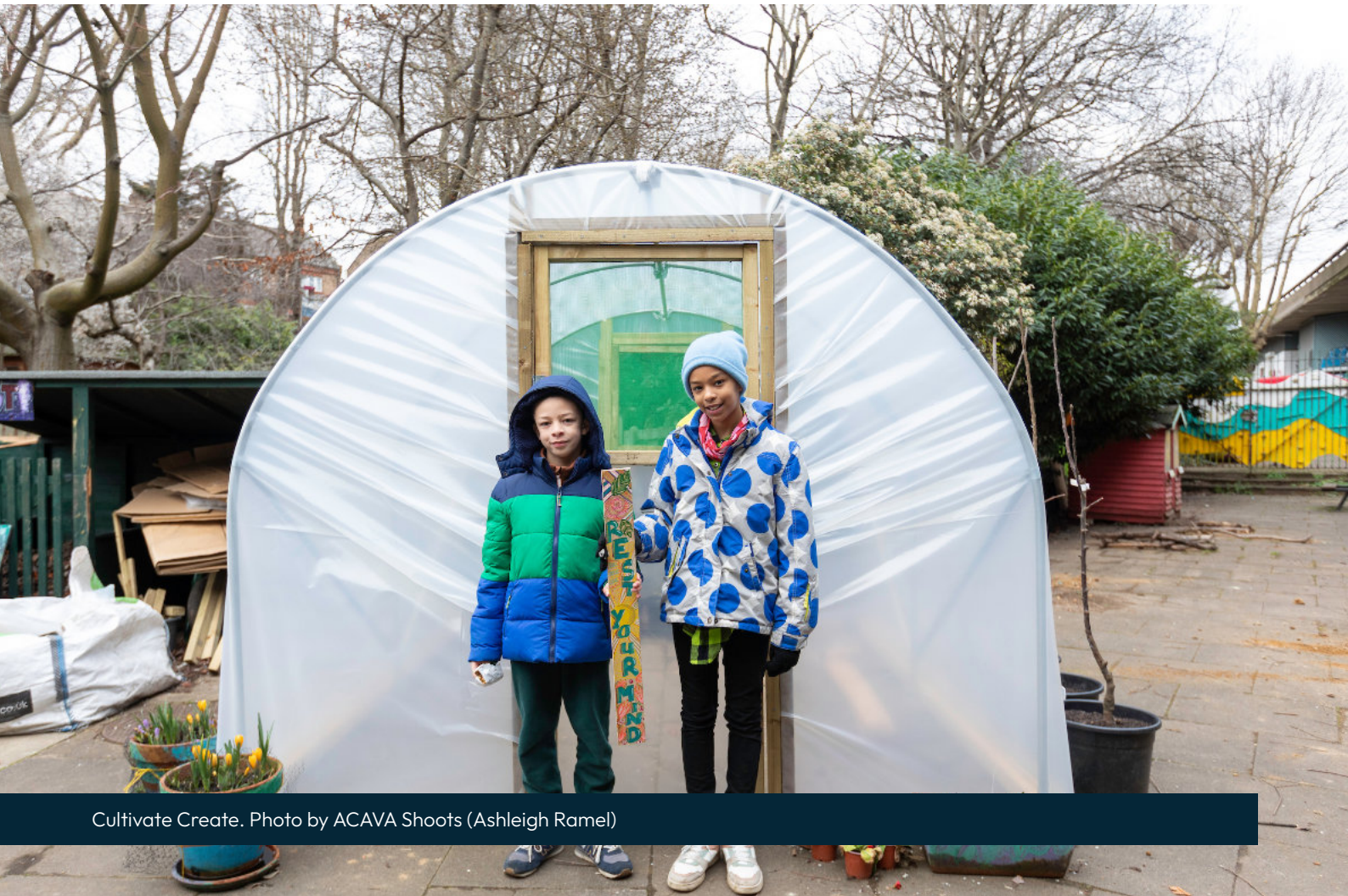
Cultivate Create.