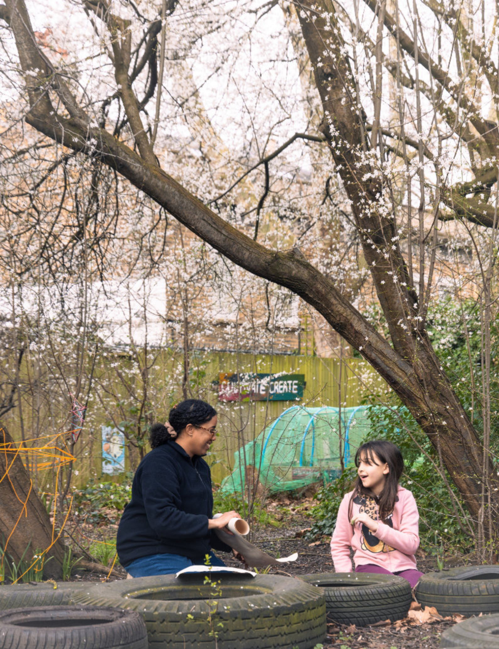
Flourish at Maxilla Walk Studios in North Kensington.