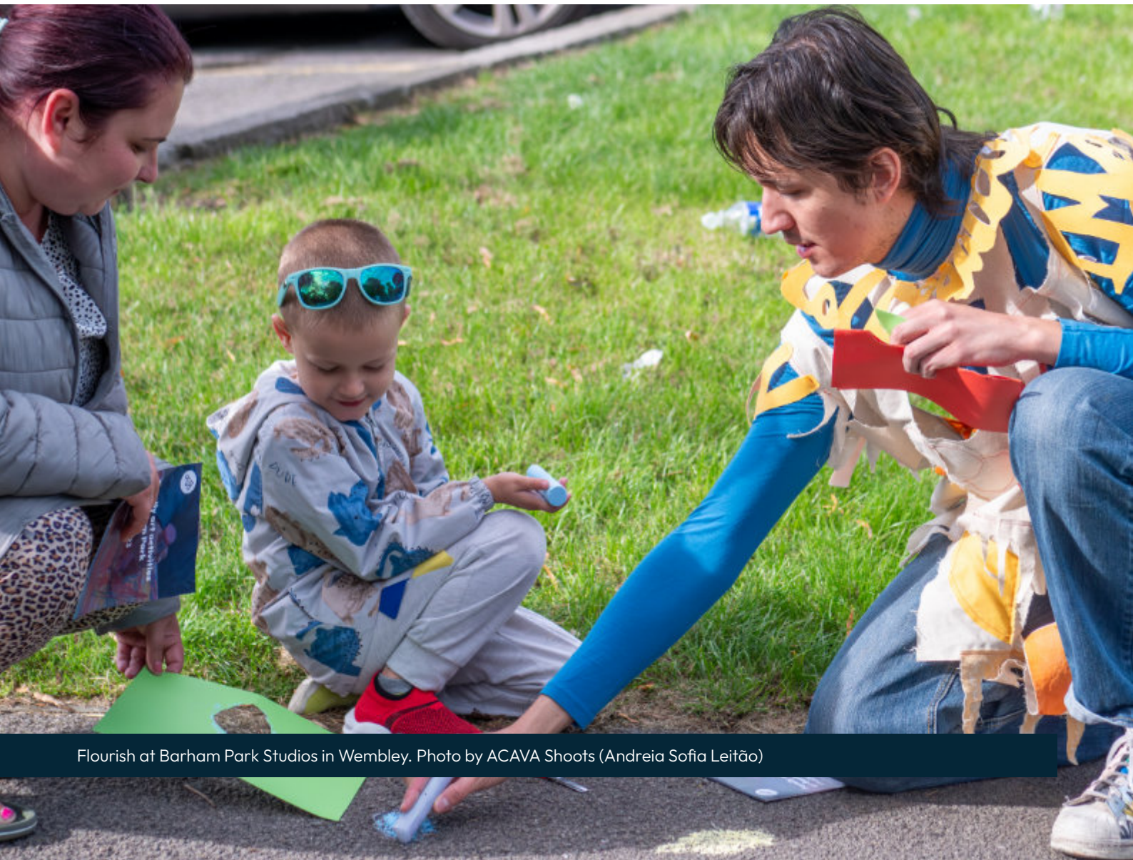
Flourish at Barham Park Studios in Wembley.

ACAVA are seeking a Project Assistant with a creative background and/or experience of community work to support the delivery of our creative family programme, Flourish, in North Kensington and Wembley.