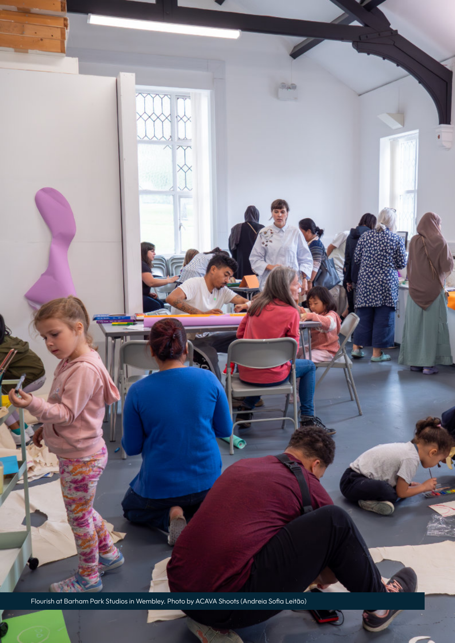
Flourish at Barham Park Studios in Wembley.