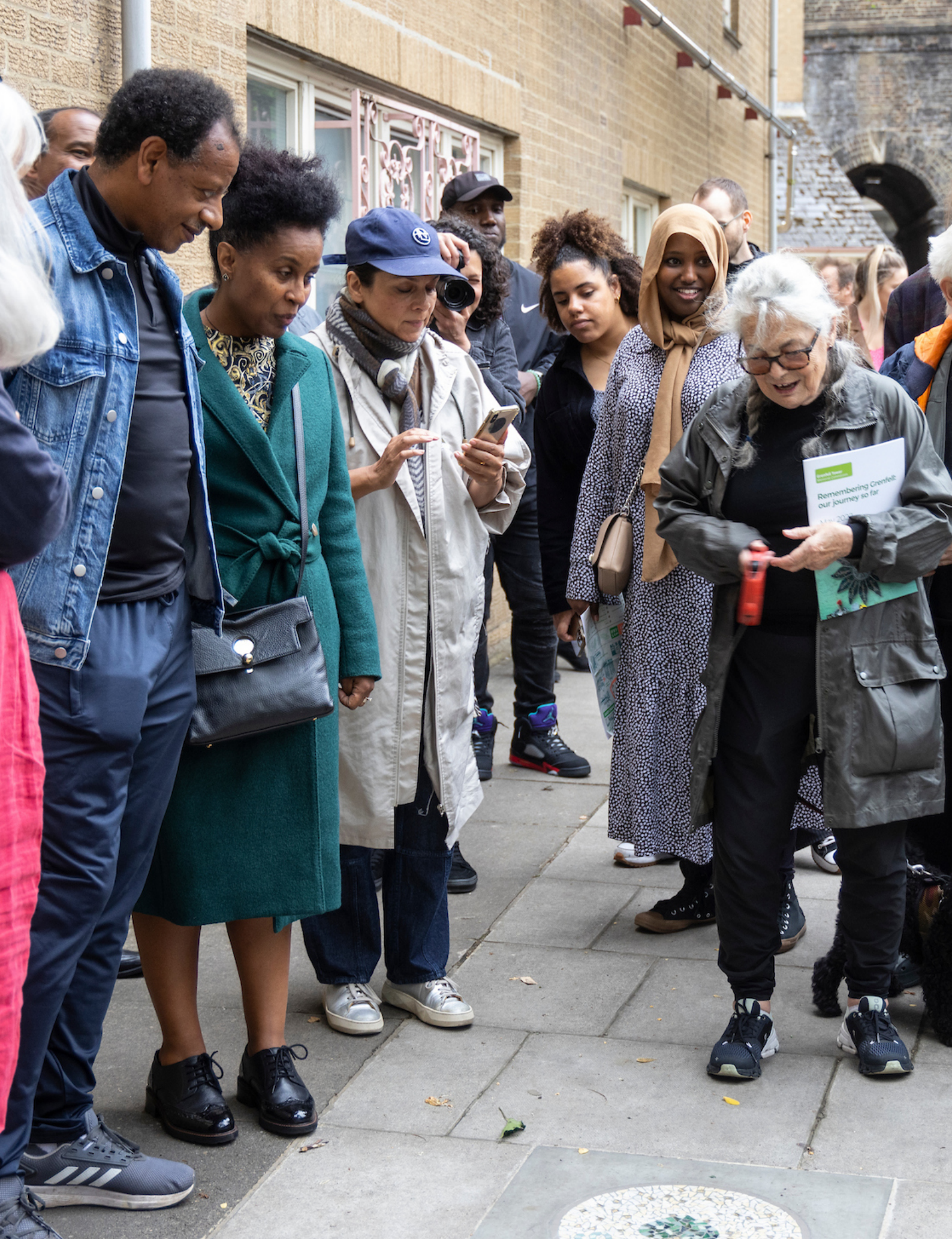
Grenfell Memorial Community Mosaic: Walking as One, installation on the streets of North Kensington, London