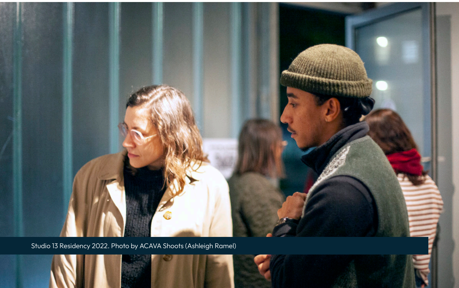
Studio 13 Residency 2022.

After completing the residency, the artist will enter ACAA's pool of artist facilitators, and will be offered opportunities for paid work delivering workshops for other ACAA projects.