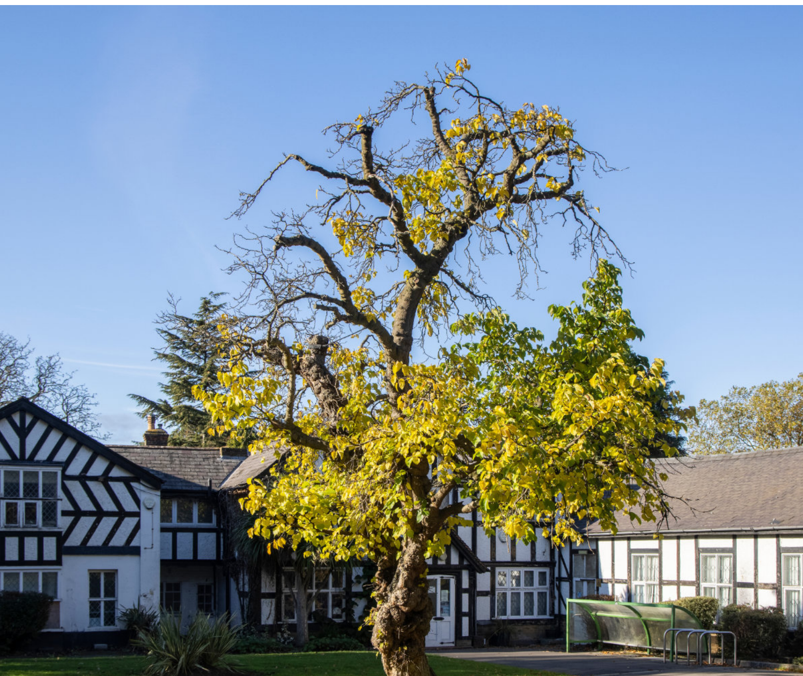
Barham Park Studios, London.

In April 2023 ACAVA joined Arts Council England's National Portfolio of regularly funded organisations, enabling us to expand our co-created arts programmes to Brent – one of ACE's priority places for increasing access to creative and cultural experiences. This new activity will be delivered from our studios and community space in Barham Park.