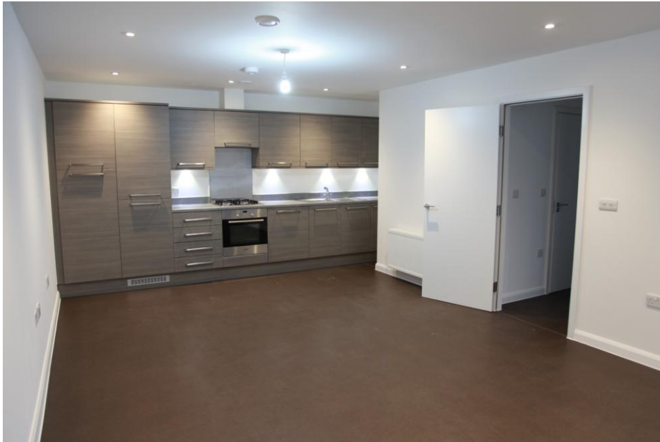
Open plan Kitchen / Living Room