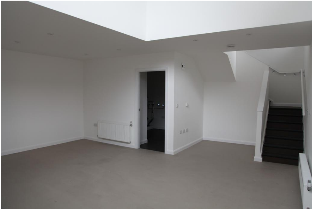
Ground Floor 690 sqft